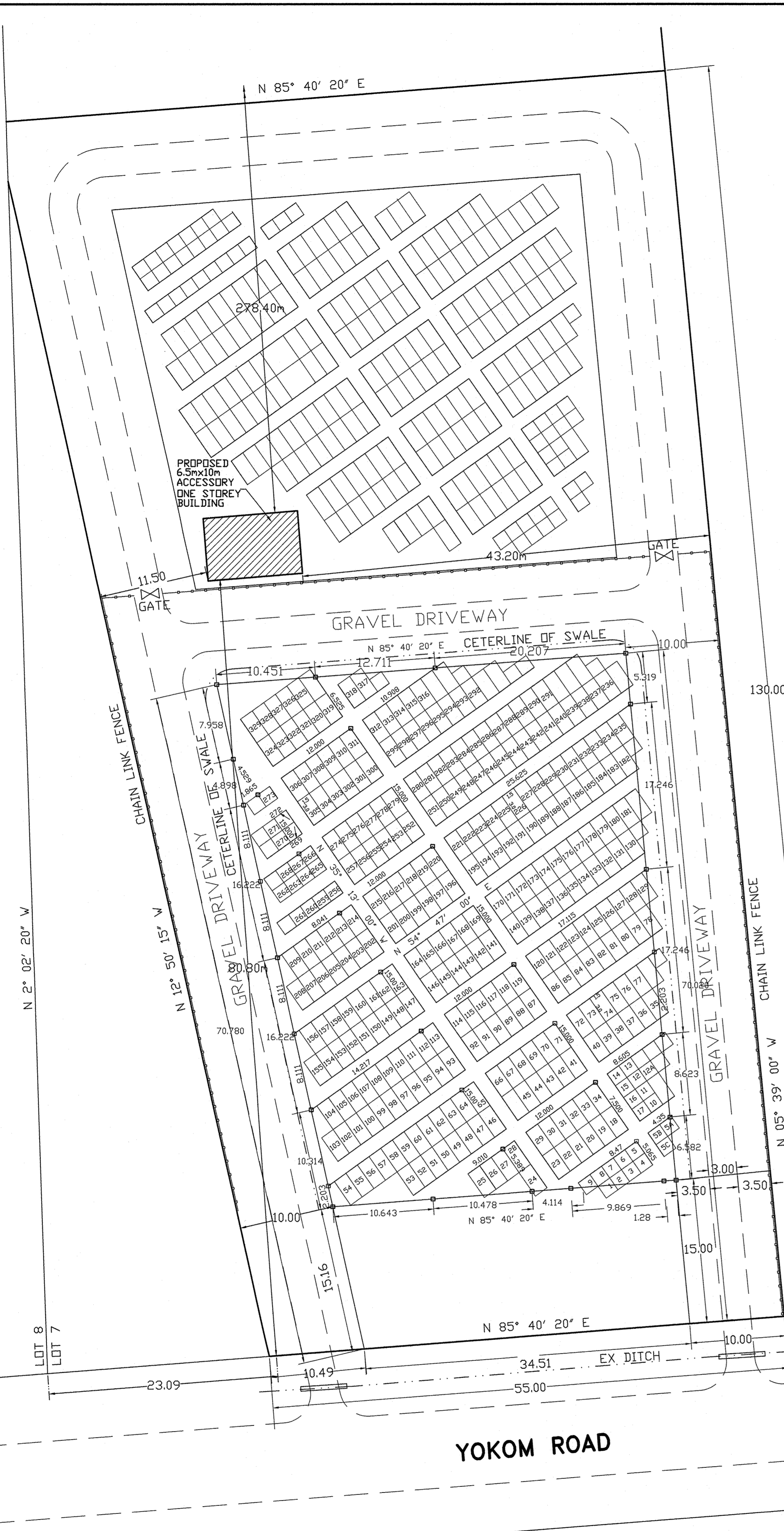
PARTIAL PROPERTY PLAN SCALE 1:300